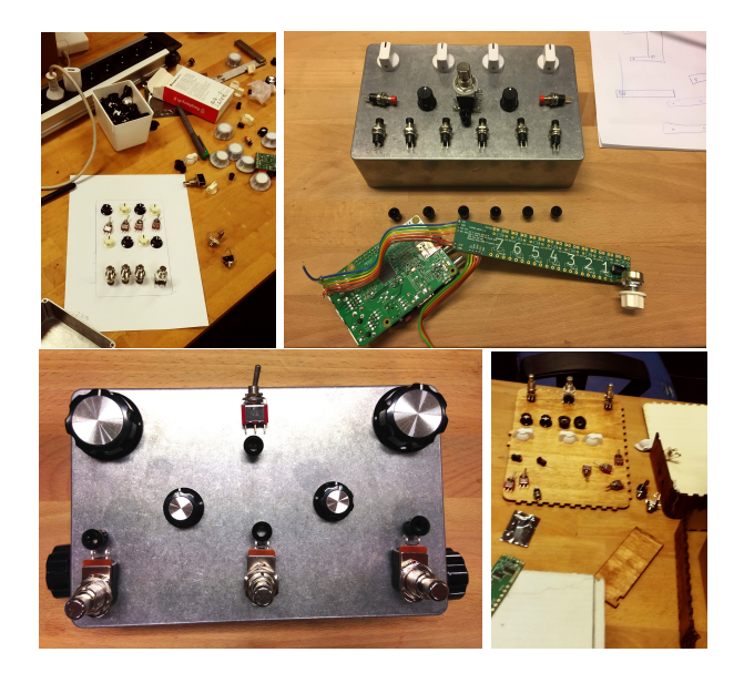
Figure 2: Photos taken during the workshops, while participants design their layout for the front panel, either on paper (top left) or on the enclosure, by arranging the caps of knobs.