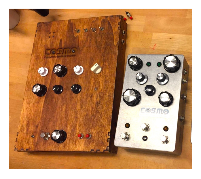
Figure 3: Example of finished designs for COSMO boxes which originated from the project.

Figure 1 gives an overview of the three step procedure starting with the interface design by the user, followed by an automated validation process and an automated generation of the underlying software instrument. An approach we describe as interface focussed instrument design .