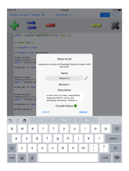
Figure 2: Uploading a new document.

erence client, or the application-agnostic client-side library (exactly which can be inferred from context but is generally not significant in this discussion).