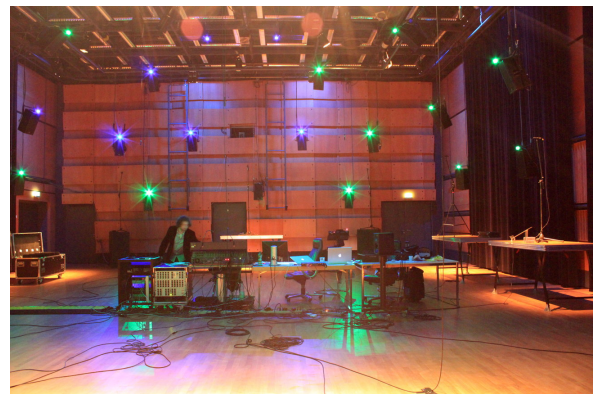
Figure 3, The Klangdom at ZKM, Karlsruhe

The Klangdom at ZKM is a small concert hall equipped with a digital mixer and 47 independent speakers. The setup is made up of four rings of speakers. Channels 1- 14 constitute an outer/lower ring, channels 15-28 constitute a slightly higher ring, channels 29-36 constitute a more centered, higher ring, channels 37-42 constitute an even more centered, still higher ring, channel 43 is at zenith and channels 44-47 are subwoofers (one in each corner) [13].