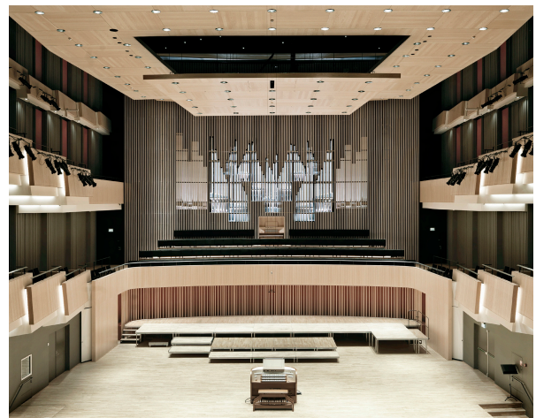
Figure 4, Symphony Hall, Aarhus

Finally I experimented using a 12-channel speaker setup at Symphony Hall in Aarhus, a hall with a seating capacity of 1,200 that was acoustically designed for symphonic music (Figure 4). There is no permanent sound diffusion system in the hall, so I was at liberty to place the 12 speakers wherever I wished. I chose a flattened setup, using only two levels: 1) stage/ground and 2) balcony (the balcony surrounds the entire hall including behind the stage, the sides and the rear). Speakers were placed on stage (narrow stereo pair plus subwoofers) above/behind the stage (wide stereo pair), two on each side of the audience on the ground floor, two on the side balconies and two on the rear balcony.