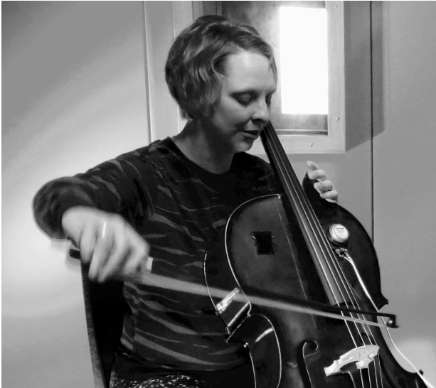
Figure 1 Augmented Cello in use.